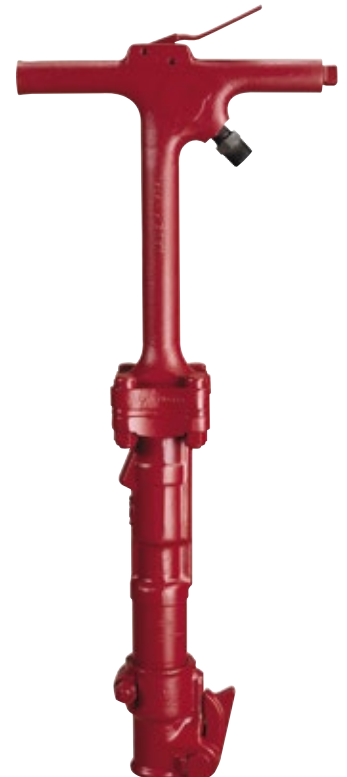
CP 0112 EX

Please Note: Non-muffled tools are not CE-marked and must not be sold for use in the EEA (European Economic Area), i.e. EU plus Norway, Iceland and Lichtenstein.