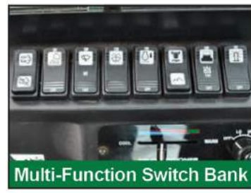
Delivering outstanding performance and versatility, the e240 is one of Green Machine's most popular conventional tail swing excavators. The e240 offers steel construction and lockable service access panels, an automotive styled interior, and a smooth and powerful hydraulic system. The e240 has excellent breakout force, reach and lifting capacity

for maximum productivity making it a great choice