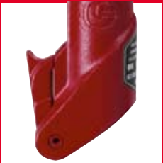
CP 0222 retainer latch