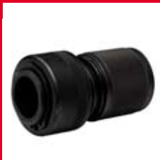
Quick change retainer