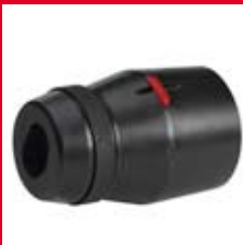
Quick change retainer

Chicago Pneumatic accessories are available to make your hammer even more effective. Make steel replacement even quicker by using one of our quick change retainers. Extend the life of your hammer by removing moisture and