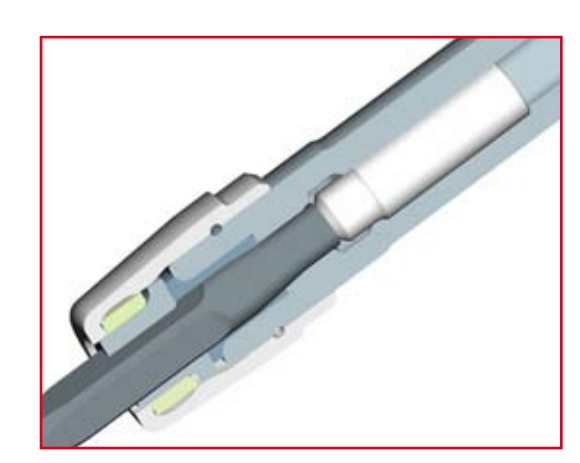
With the stepped piston design and step cylinder, CP 4181 model "V" replaces the industry standard CP 4181 model "A" rivet buster.